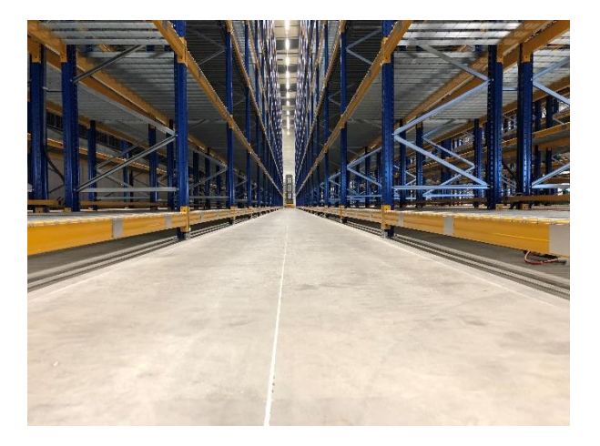
Figure 11, High-bay warehouse for water-polluting substances, production area for water-polluting substances

The silicate technology of Sinnotec GmbH is an innovative approach in concrete repair, which directly addresses the cause of concrete corrosion, namely the chemical reaction of the reactive, acid-sensitive secondary component calcium hydroxide in the concrete matrix. The conversion into thermodynamically stable calcium silicate hydrate (CSH) simultaneously seals the capillary porosity of the concrete matrix and provides lasting inorganic protection. By realkalizing and waterproofing the steel reinforcement (active principle W), a lasting protection of reinforced concrete and aesthetically beautiful floors with high sustainability is achieved.