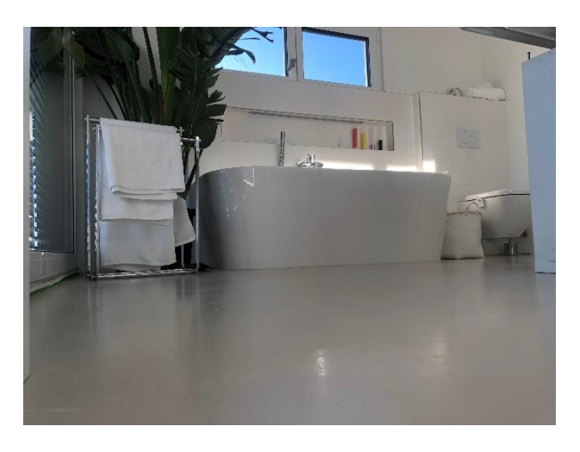
Figure 5, Sinnofloor Design, jointless industrial flooring, crack-free and highly resilient, also for exterior surfaces and wet room floors

compound Sinnofloor Design grey was used, as well as Sinnofloor CW 2in1 for oil-resistant impregnation the following day. Since then, the surface has proved to be non-slip and well protected against mechanical stress, soiling of all kinds and chemical substances such as aggressive cleaning agents. The separately designed floor presents itself seamlessly throughout and thus top-hygienic, which is also proven by the sealing groove, which was professionally raised on the surrounding walls in the base area. All in all: the renovated floor in the restaurant could hardly have been easier to maintain and more robust.