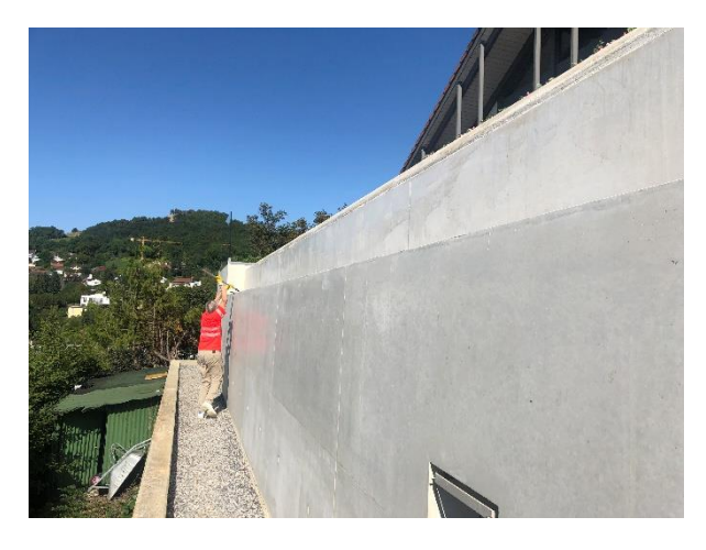
Figure 10, Pool made of white Jura cement, fully protected

Since Sinnotec products are mixed with water in an exemplary and environmentally friendly manner and do not contain any other hazardous ingredients or solvents, they have drinking water approval and are free of microplastics. Thus, an application in swimming pools and drinking water structures is ideally realizable. Due to its excellent environmental compatibility, we have currently implemented a cooperation with Ardex and Bau-Fritz for a very low-emission design floor in residential construction. The shining reference here is the swimming pool made of white concrete (Jura lime) in Dornach, Switzerland.