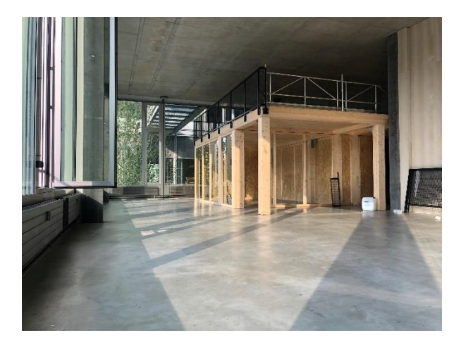
Figure 8, Yond, Zurich most flexible rooms for innovative companies

Due to the high chemical stability, which is applied liquid-tight and crack-free on the surfaces, applications for laboratories, production plants, storage areas, HBVplants, LAU-plants (9) in chemical, pharmaceutical, agricultural and food industry are comfortable and can also be realized as renovation during operation. The best protected reference is the new and highest production building L900 of BASF in Ludwighafen, where the entire production and storage area is protected over 14.000m<sup>2</sup> over 7 floors with 84 meters height.