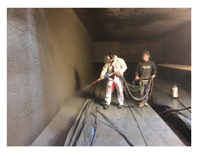
Figure 12, reprofiled concrete in industrial sewage treatment plant according to WHG

These materials are therefore predestined as sealing (even in case of rear moisture penetration and salt contaminated substrates) for industrial floors and can even be used with aggressive media, such as water-polluting substances (16, 17, 18) according to the tightened Water Resources Act (WHG) for HBV systems (production areas, industrial floors) and LAU systems (e.g. tank farms, tank and storage areas).