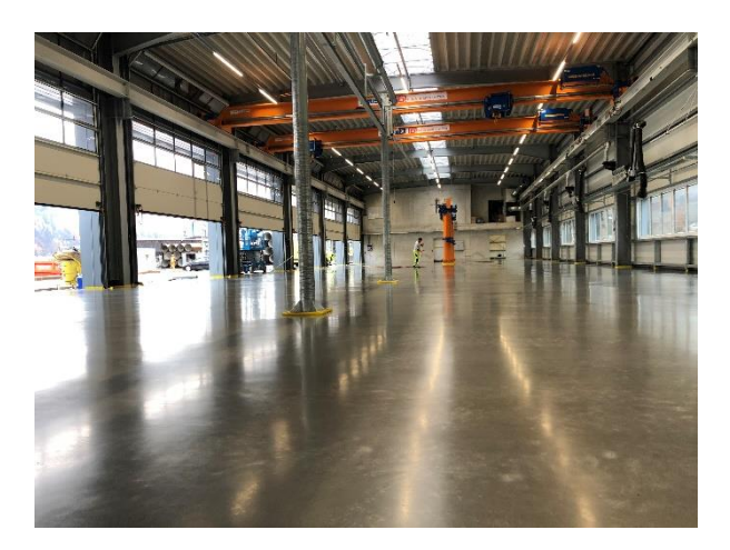
Figure 6, spray application Impregnation, large surface

The concrete refinement by Sinnotec Silicate Chemistry is essentially based on the reaction of calcium with water glass to form calcium silicate hydrate (CSH). Impregnation by Sinnotec products is thus the chemical reaction of calcium hydroxide with water glass (silicate) to form calcium silicate hydrate, thereby solidifying the microstructure (CSH is no longer water soluble and thermodynamically stable) and sealing the capillary porosity. Sinnofloor© Impregnation for concrete finishing is a one-component dust-binding coating system (water-based, VOC-free) which can be easily applied by spraying or wiping onto the concrete surface.